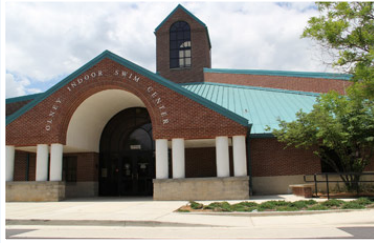
Olney Indoor Swim Center