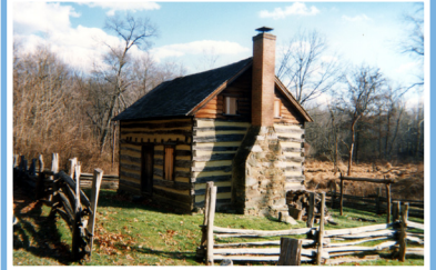
Oakley Cabin African American Museum