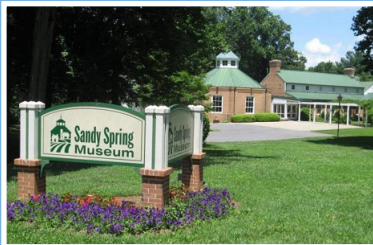
Sandy Spring Museum