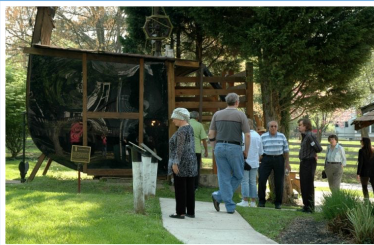
Sandy Spring Slave Museum