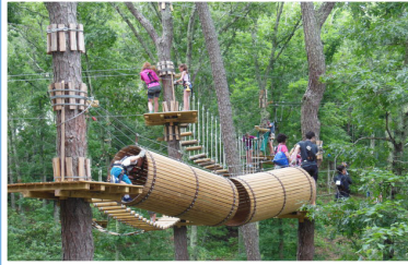
Adventure Park at Sandy Spring Friends School