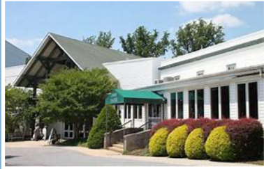
Olney Theatre Center