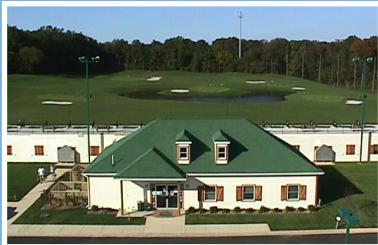
Olney Golf Park