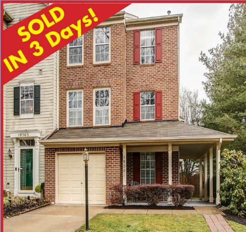
James Creek Charmer 18501 Grapevine Way $424,900

2020 is going to be a Great Year to Sell a Home! Our Listings are Selling Fast...Inventory is LOW