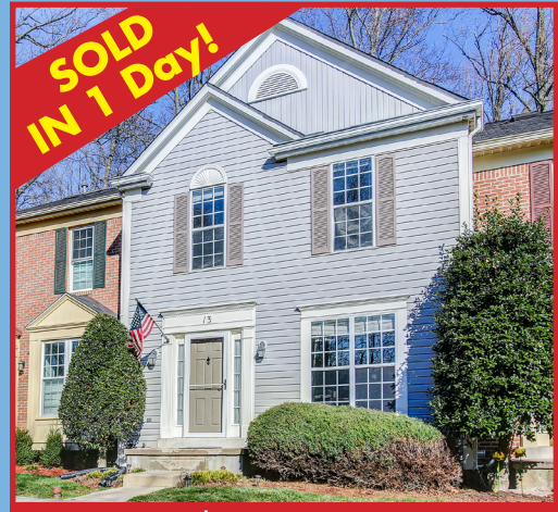
Christie Estates "Right out of Pottery Barn" 13 Fiddleleaf Court $429,900

Our Results can be Your Success Top Dollar and Fewer Days on the Market!