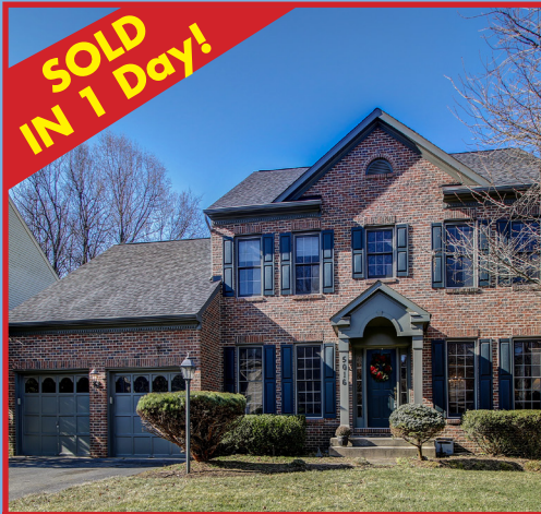
Norbeck Grove Backing to Park 5016 Tothill Drive $705,000