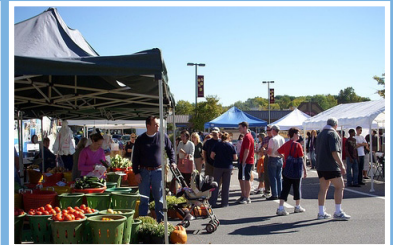
Olney Farmer's and Artist Market

ALSO VISIT: Field of Screams Maryland and Olney Manor Dog Park